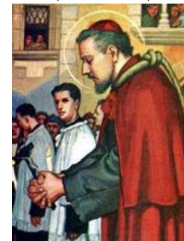
November 4 Patron of Seminarians and Catechists

Oh God, Maintain in your people that spirit with which you inspired your Bishop St. Charles, so that your church may be constantly renewed, conforming itself to Christ and manifesting Christ to the world.